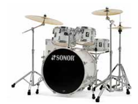
Stage Setup (additional items shown)

The AQ1 Series defines the entry into the world of the SONOR Sound - a birch shell kit, completed with a 5-piece 2000 Series hardware pack in our 2 popular configurations Stage and Studio, available in 2 classic, yet stunning high gloss lacquering finishes: Piano Black and Piano White.