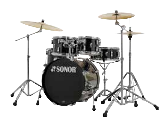
Studio Setup (additional items shown)

The AQ1 Series has been newly designed and engineered from ground up by the SONOR team in Bad Berleburg, Germany. Designed not only visual by a new lug and badge but also acoustical by the isolating "SmartMount" that allows for significant better resonance and sustain of the 100% all birch shell rack toms. If you're an ambitious beginner or already a SONOR enthusiast looking for the additional stage-ready drum kit – AQ1 is for you.